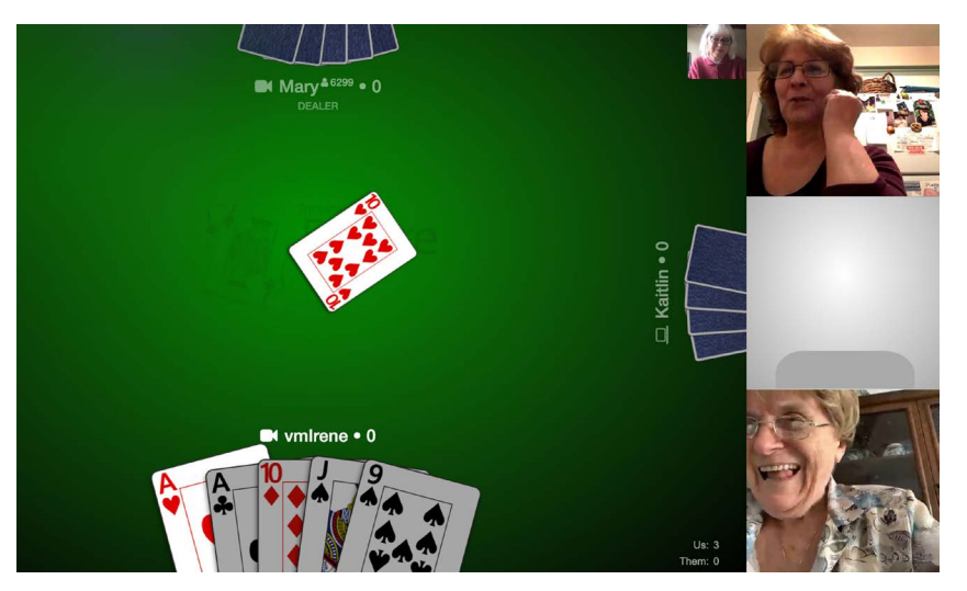
Virtual Euchre with Village Mosaic

for those who might otherwise not have access to them – is central to Fontbonne Ministries' mission. We are grateful for the many lessons that the COVID-19 pandemic has taught us, and for the continued resilience and enthusiasm of our participants as we found new ways to serve and support them.